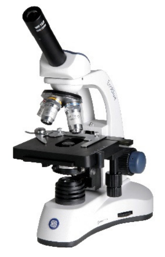
Model with integrated X-Y mechanical stage EC.1051

PB.5155 Microscope glass slides 76 x 26 mm, edges grinded, 50 pcs PB.5168 Cover glasses 22 x 22 mm, thickness, 0.13-0.17, 100 pcs PB.5245 Lens cleaning paper, 100 sheets PB.5255 Immersion oil n = 1.482, 25 m