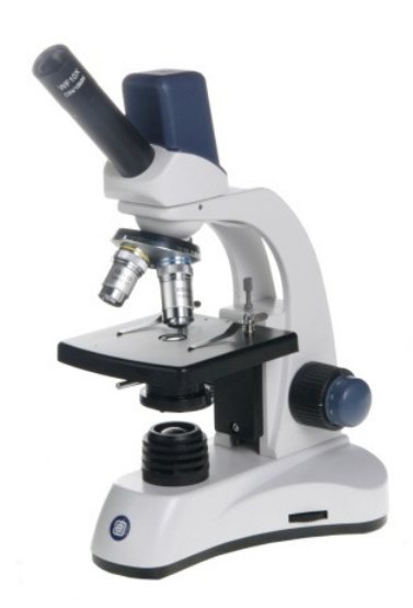
Digital model EC.1005